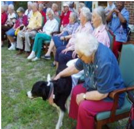
OREO visiting residents of an assisted living facility after putting on a Frisbee and tricks show.

Oreo Cookie at the wonderful age of 10 just became a Delta Society Pet Partner.